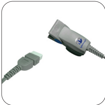
Adult Finger Clip