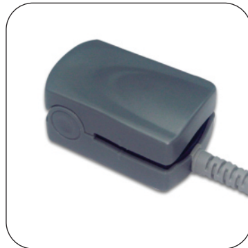
Pediatric Finger Clip