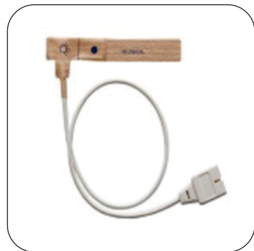
Pediatric Disposable Tape