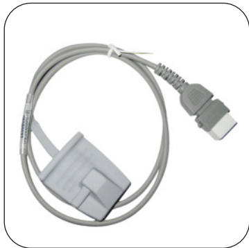
Adult Rubber Boot

VirtuOx carries the following generic probes: BCI, Datex Ohmeda, Nonin, Nellcor, Nellcor Oximax