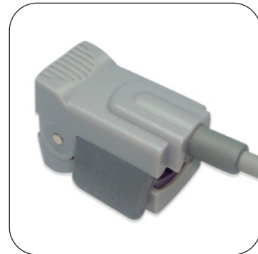
Infant Finger Clip