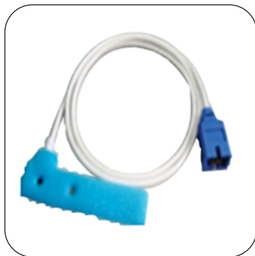
Adult & Pediatric Disposable Foam